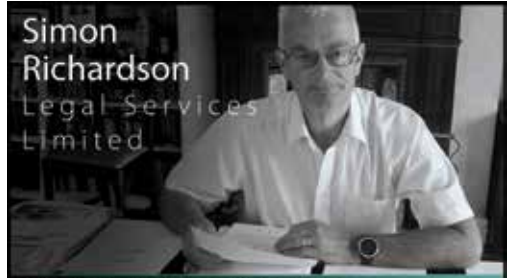
Simon Richardson Legal Services Limited

Having been a walk around the farm boundary just lately to check for breaches, we were lucky enough to see a pair of Kingfishers flit along the brook. What an amazing sight of iridescent blue amongst the green.